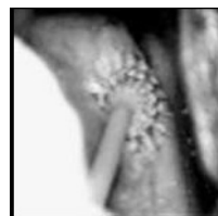
Sampling with SpiraBrush CX ®