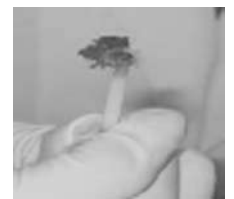
Adequate Sample Brush head is covered with bloody mucoid material