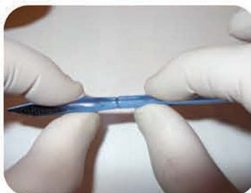
Separating head of device from handle