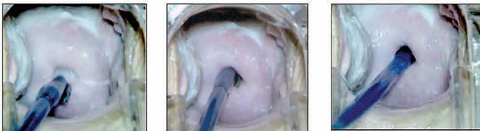
Soft ECC® device being inserted gently and completely inside cervical canal.