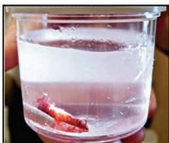
Detached device head filled with tissue in vial