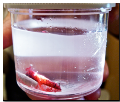
SOFT-ECC-S® FABRIC-FILLED DEVICE HEAD IN VIAL