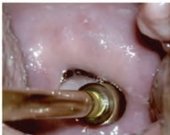
Application and Rotation

Samples of tissue should be carefully and completely removed from the KYLON® fabric in the laboratory and may be processed and evaluated using a standard histologic technique. The specimen contains abundant multiple histology samples that can be removed by simply scraping the fragments off the KYLON® pad with a small fine comb, knife blade, or tweezers.