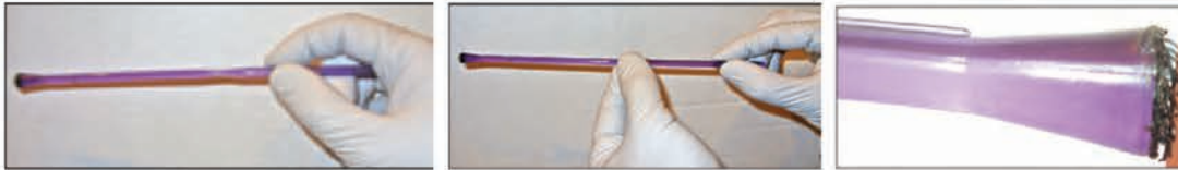
One and two handed technique on applying the device and guiding the biopsy procedure.